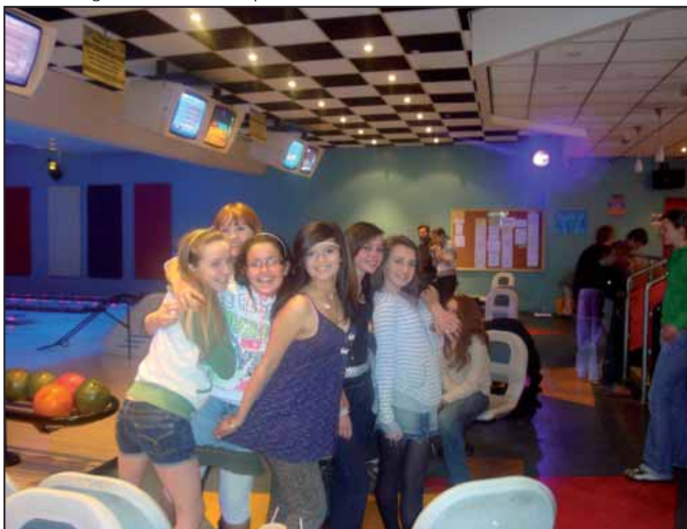
Unity ten pin bowling night

We praise God for all the good things which are happening in the life of the church and for all those involved in helping in all the different ministries.