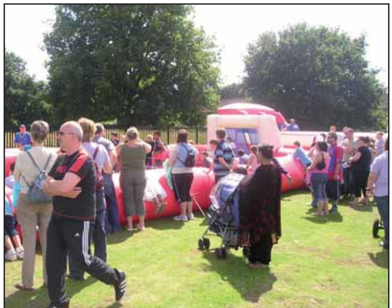
An EBC organised community funday.