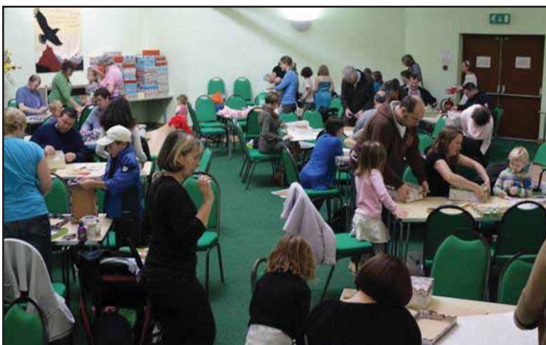
Shoe boxes in progress

At our Church Meeting in November we agreed together our objectives for 2010. These include increasing the effectiveness of our youth work, identifying potential future leaders, establishing a permanent base for our