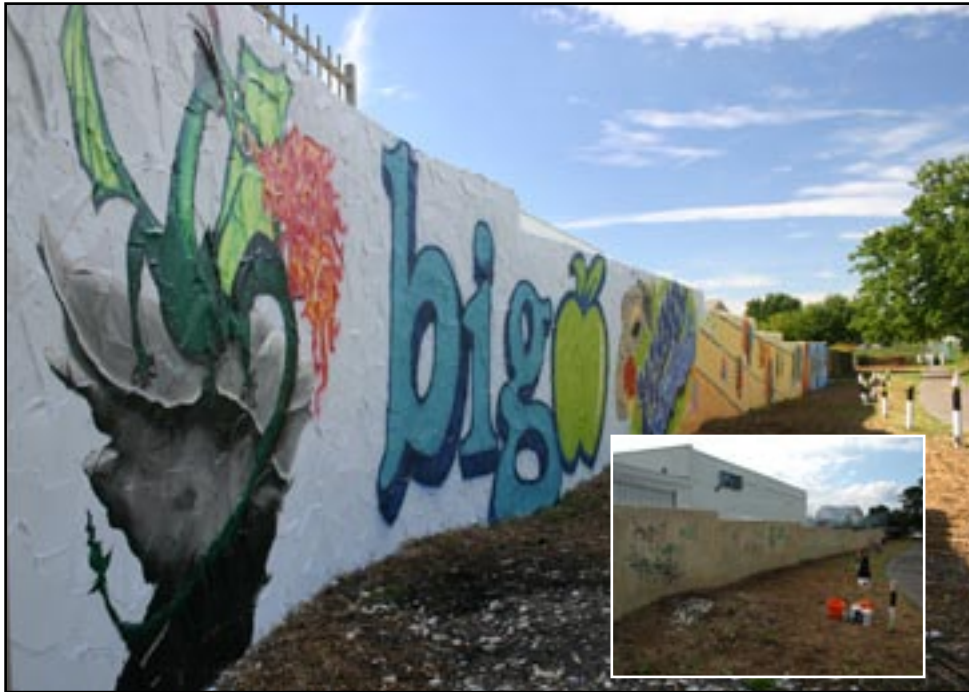
Above and previous page: Selected highlights of the community projects