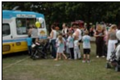
This page: Pictures from the three community events.